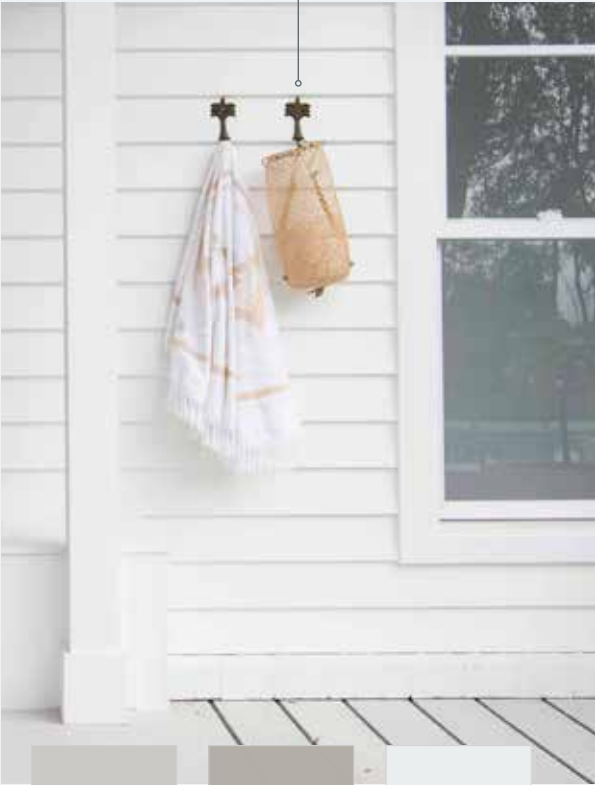
Dulux Dieskau™ Dulux Winter Fog™ Dulux White on White™

Outdoor hooks are not only convenient, but emulate the Hamptons feeling.