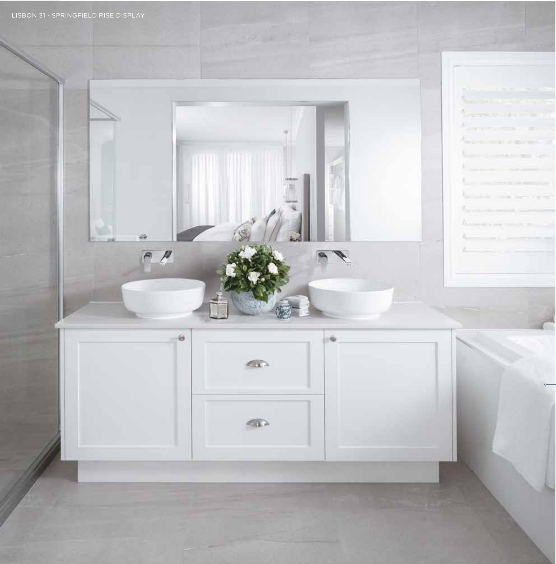
LISBON 31 - SPRINGFIELD RISE DISPLAY

Stylish white plantation shutters complete the bathroom and provide some much needed privacy for your bathroom retreat.