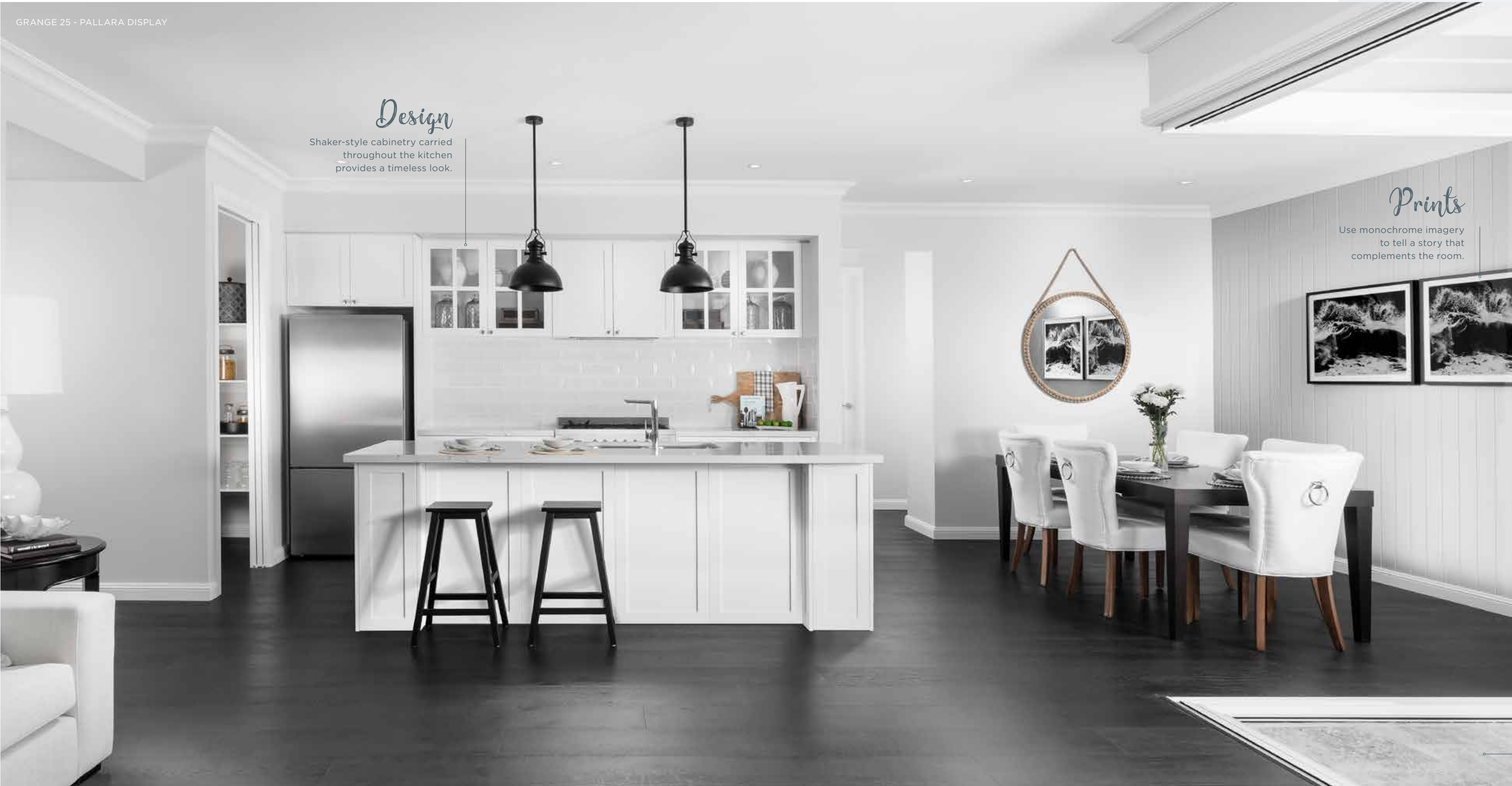
GRANGE 25 - PALLARA DISPLAY