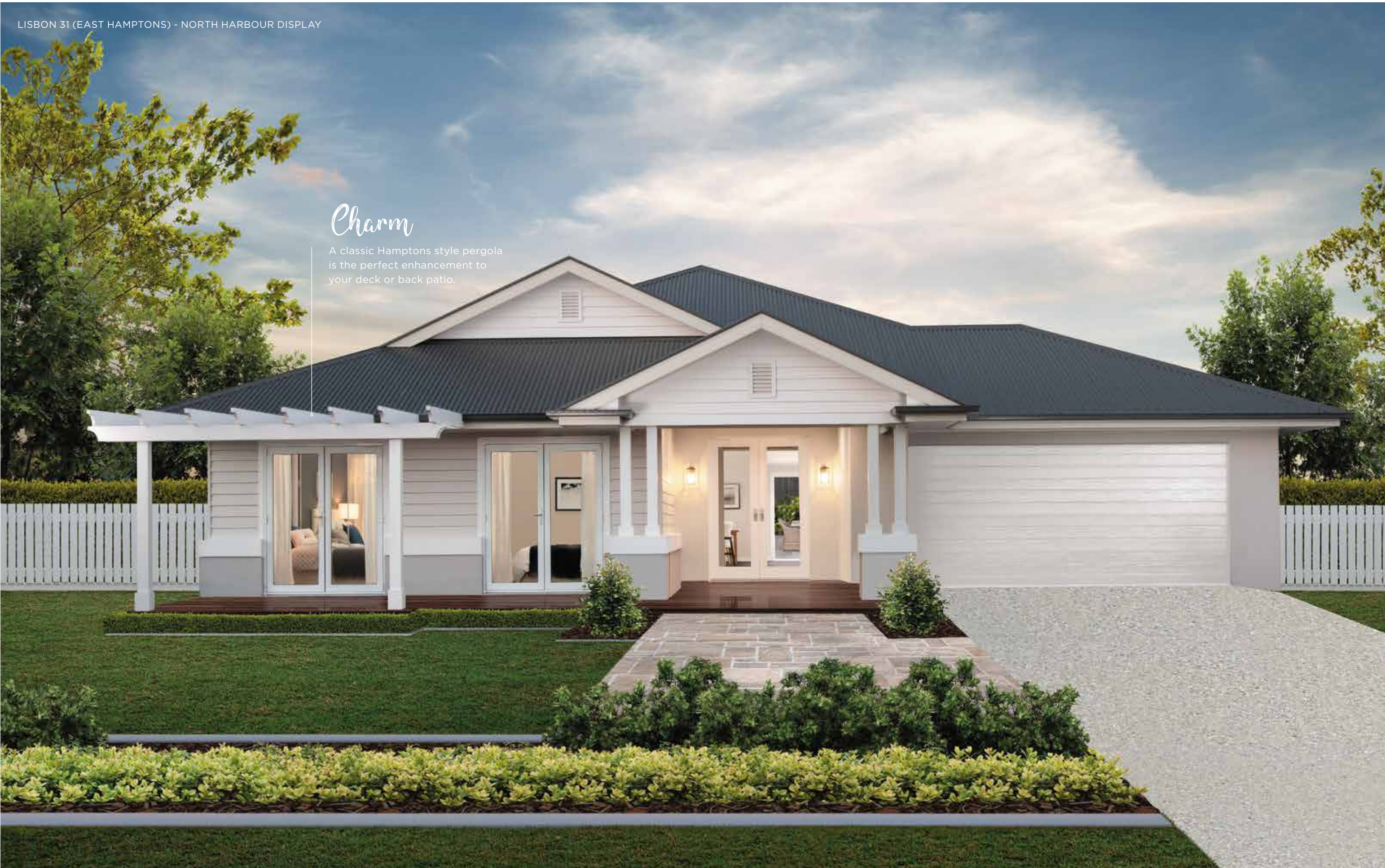
LISBON 31 (EAST HAMPTONS) - NORTH HARBOUR DISPLAY