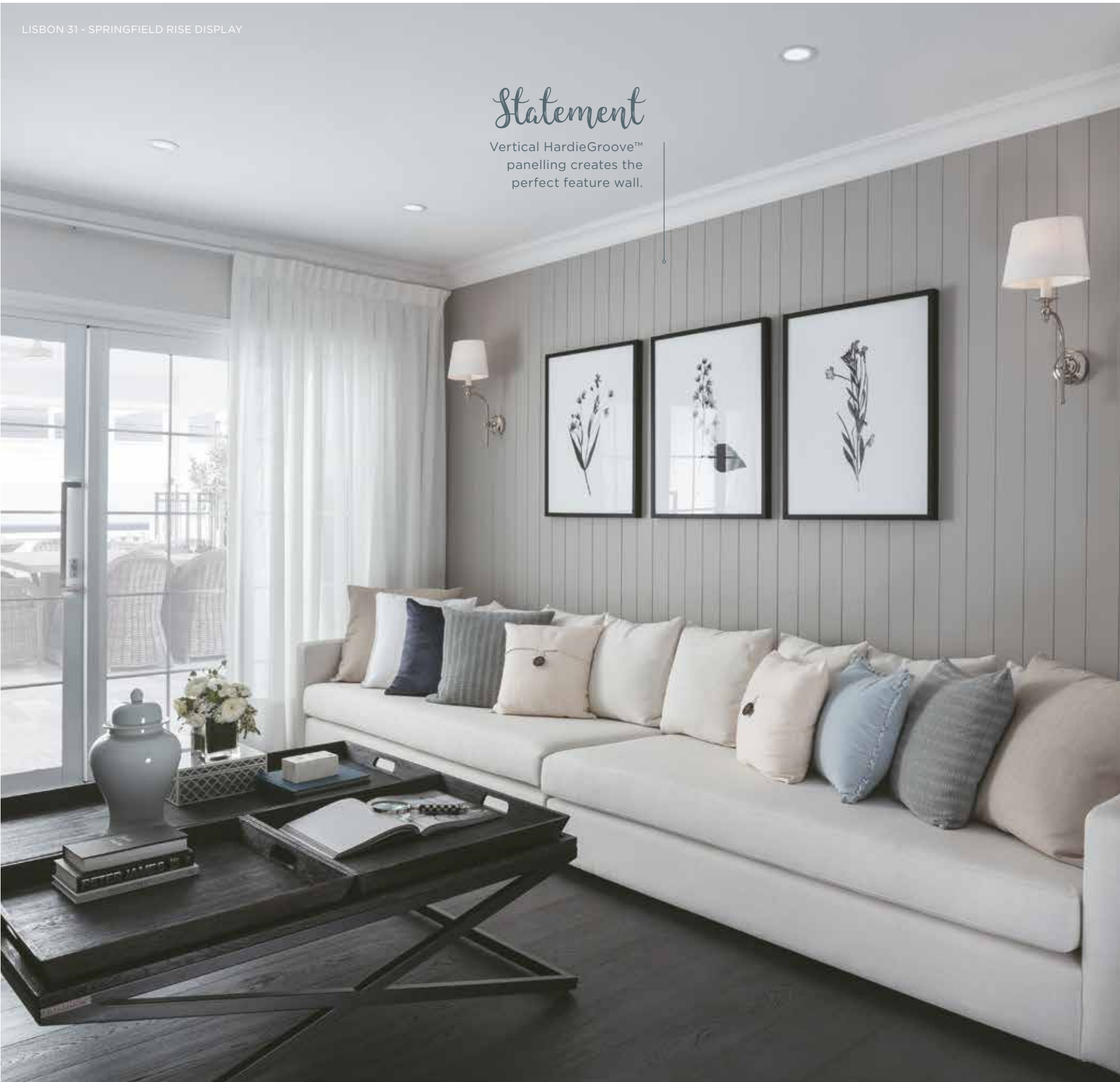
LISBON 31 - SPRINGFIELD RISE DISPLAY

Vertical HardieGroove™ panelling creates the perfect feature wall.