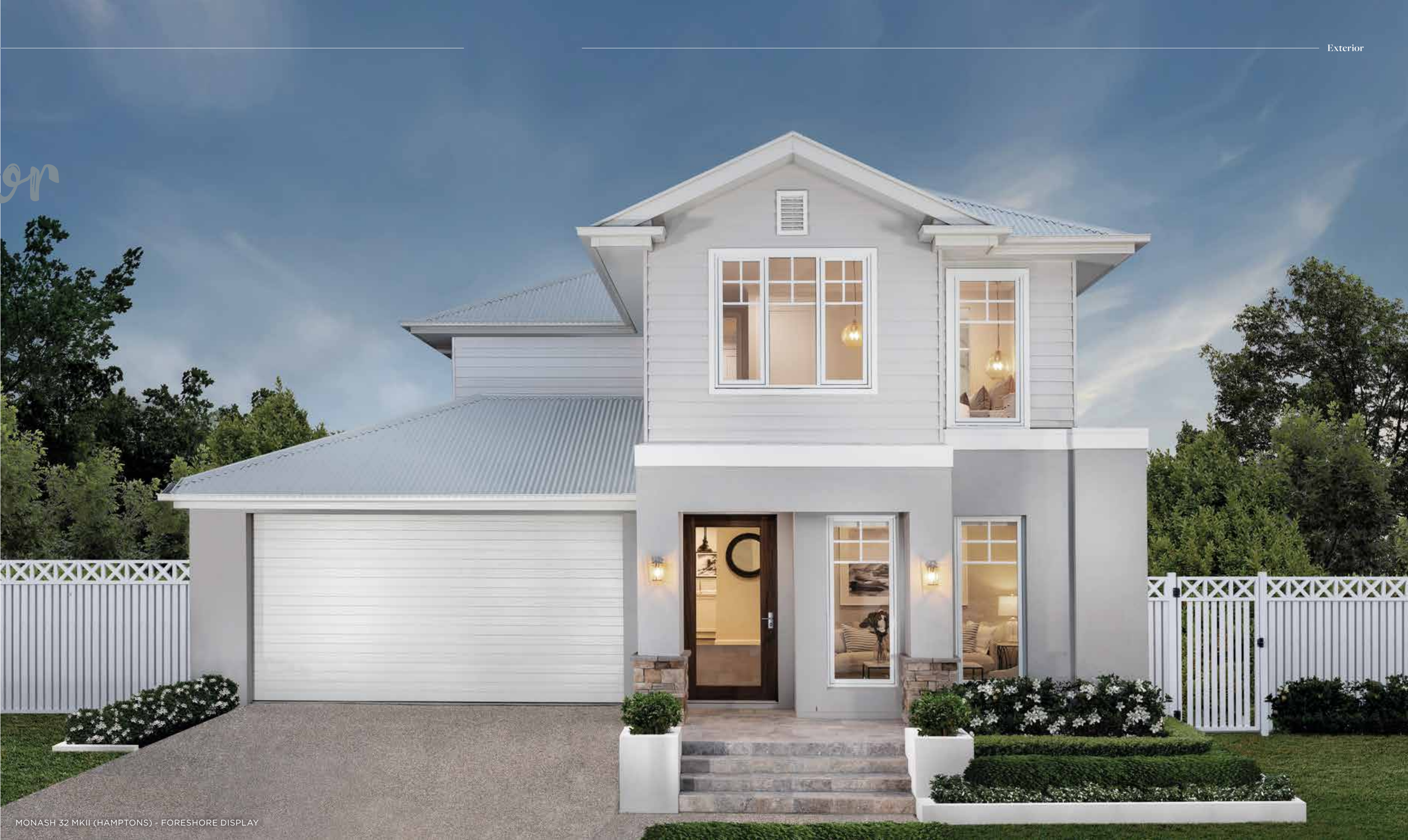
MONASH 32 MKII (HAMPTONS) - FORESHORE DISPLAY

The James Hardie™ weatherboards are 75% thicker than any other and create the bold horizontal shadow lines that work so well for classic and contemporary looks. Made from premium fibre cement, they stand up to Australia’s harsh climate and are resistant to termites, fire and damage from moisture.