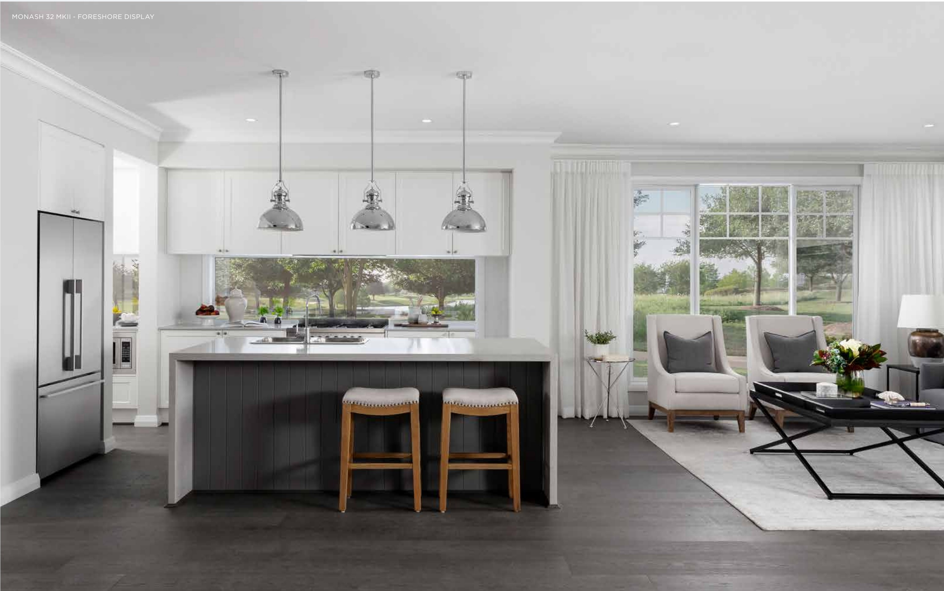
MONASH 32 MKII - FORESHORE DISPLAY

With key design elements of a traditional Hamptons home included, these premium designs are a modern interpretation of the seaside mecca's architecture, but adapted to better suit our Australian climate and lifestyle.