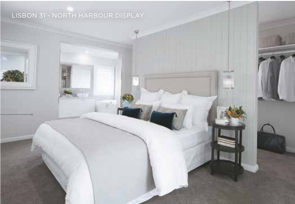
LISBON 31 - NORTH HARBOUR DISPLAY

A neutral palette with soft furnishings create a beautiful Hamptons feeling.