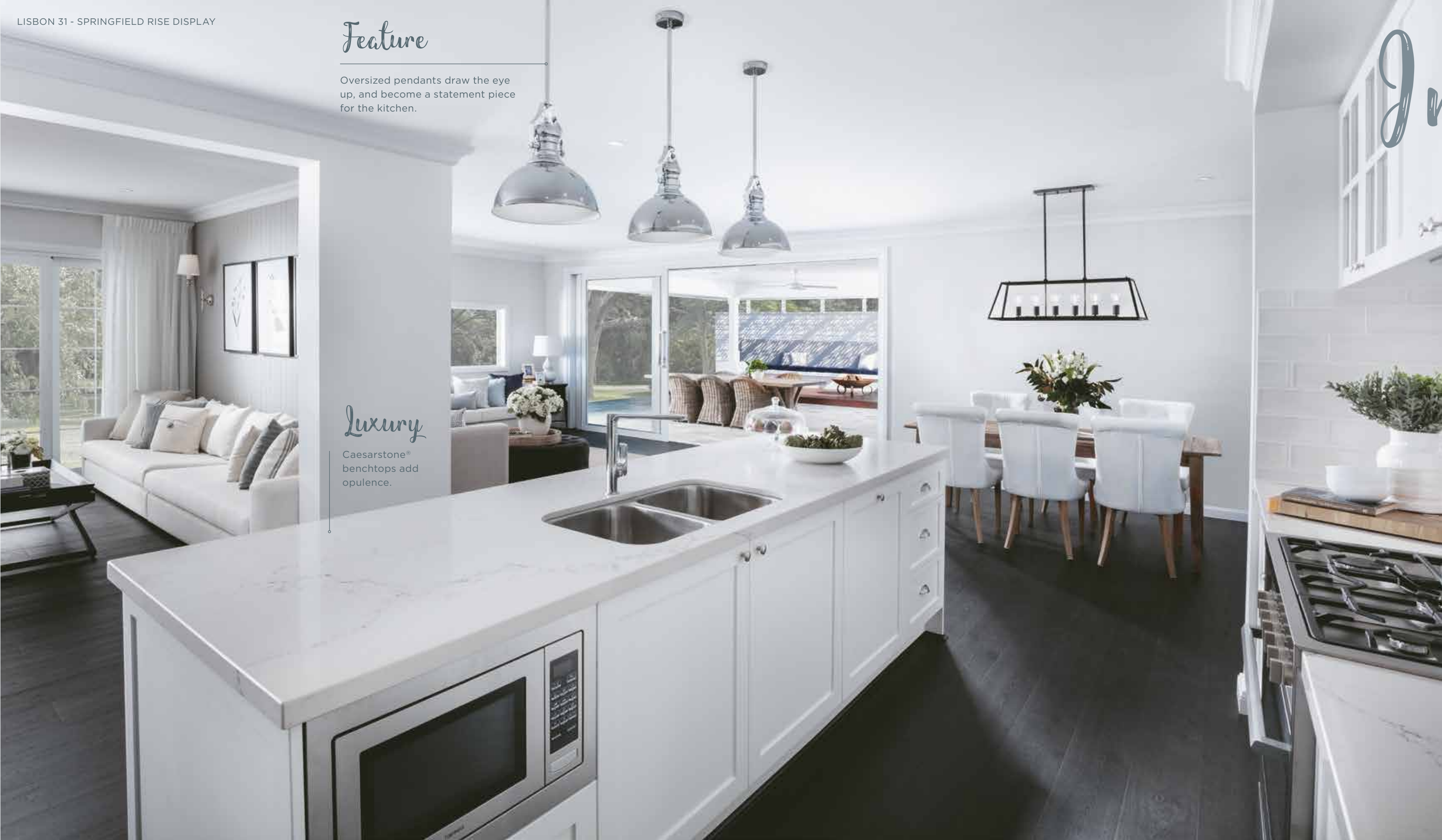
LISBON 31 - SPRINGFIELD RISE DISPLAY