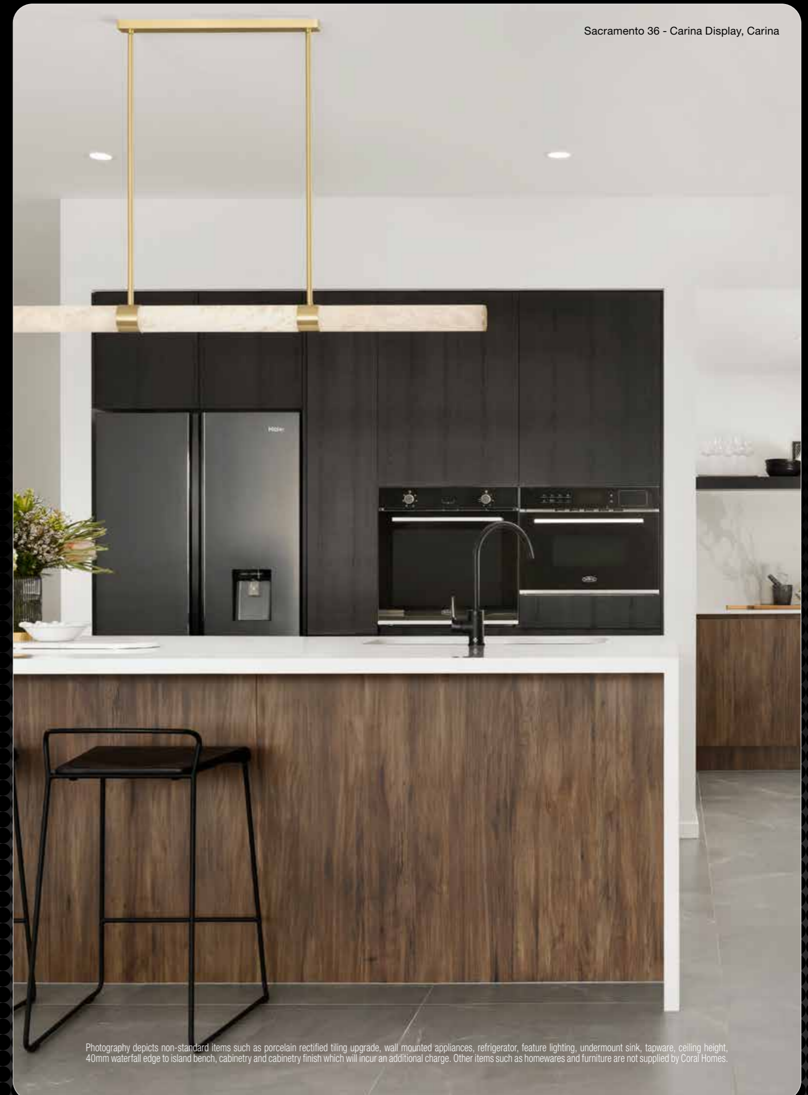
Photography depicts non-standard items such as porcelain rectified tiling upgrade, wall mounted appliances, refrigerator, feature lighting, undermount sink, tapware, ceiling height, 40mm waterfall edge to island bench, cabinetry and cabinetry finish which will incur an additional charge. Other items such as homewares and furniture are not supplied by Coral Homes.

After taking possession of the keys to their new home, Coral Homes' Service & Warranty Program gives homeowners the necessary information and tools to maintain and extend the life of their products.