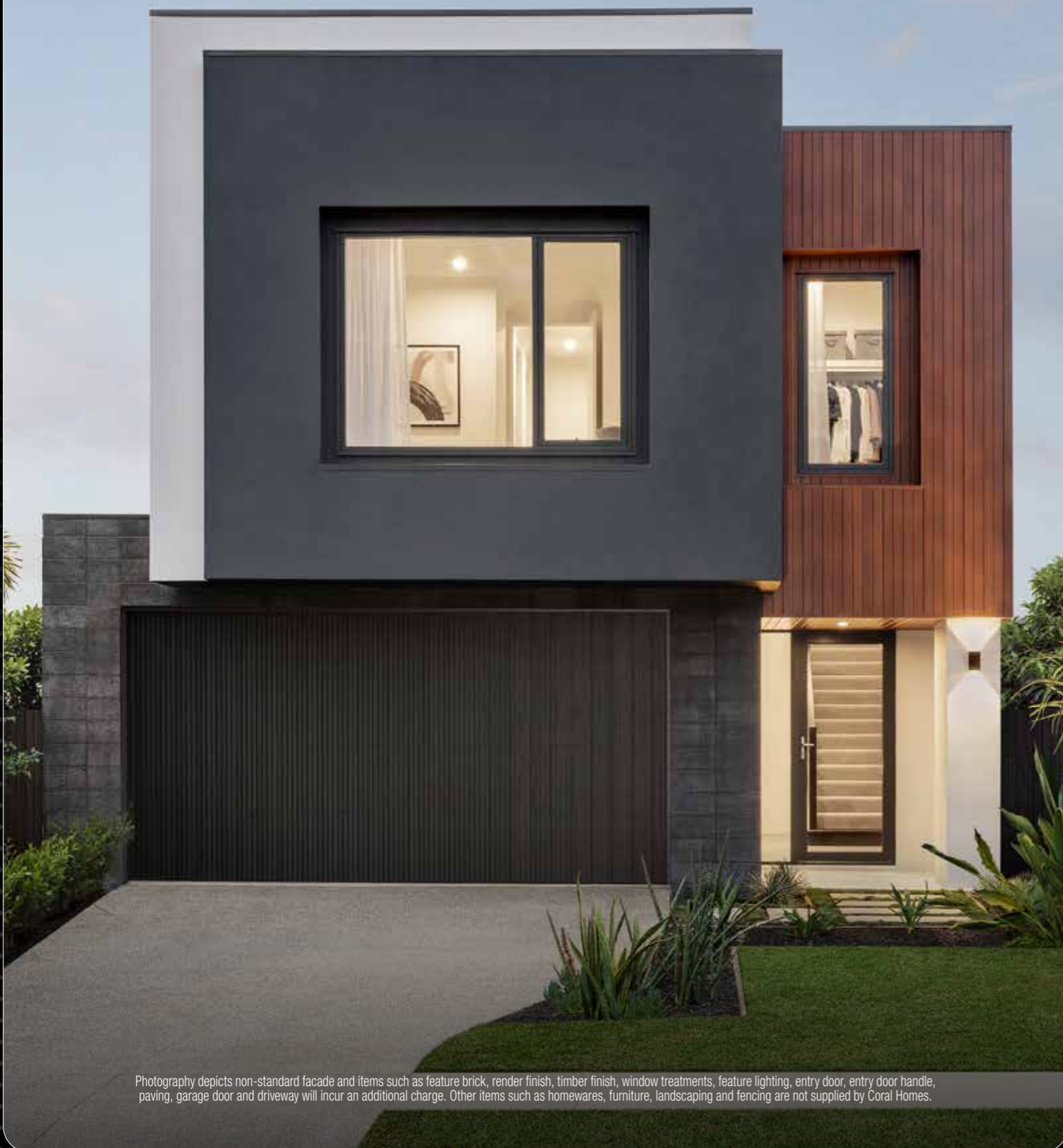
Photography depicts non-standard facade and items such as feature brick, render finish, timber finish, window treatments, feature lighting, entry door, entry door handle, paving, garage door and driveway will incur an additional charge. Other items such as homewares, furniture, landscaping and fencing are not supplied by Coral Homes.