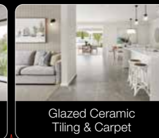
Glazed Ceramic Tiling & Carpet