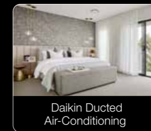
Daikin Ducted Air-Conditioning

On top of our premium Elegance Inclusions, you can enjoy six additional luxury extras with a $5,000 Selection Showroom voucher