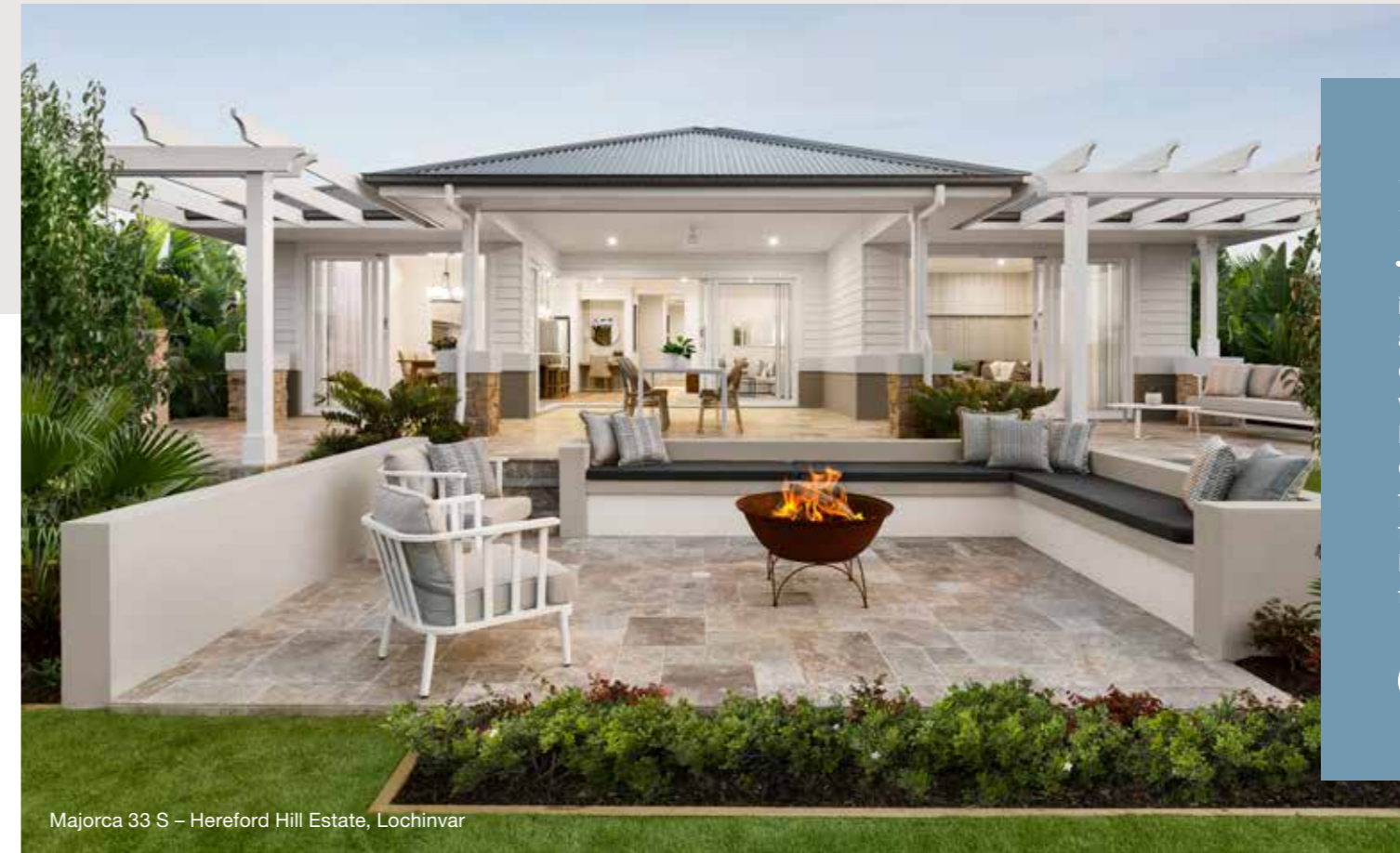
Majorca 33 S – Hereford Hill Estate, Lochinvar

A gable roof delivers the quintessential Hamptons look. The design involves two pitched roof panels meeting in the centre of the home, in the shape of an inverted 'V'. Providing both protection and style, eave returns are used as a transition between the walls and the roof of a Hamptons home.