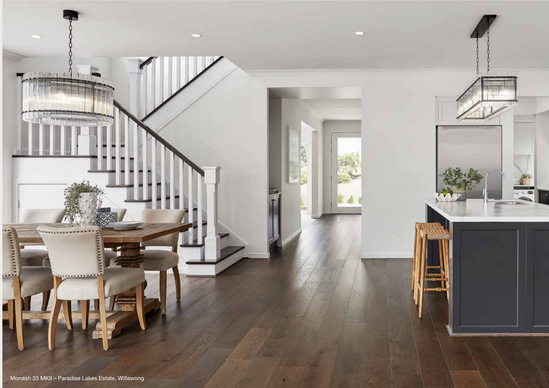
Monash 33 MKII – Paradise Lakes Estate, Willawong