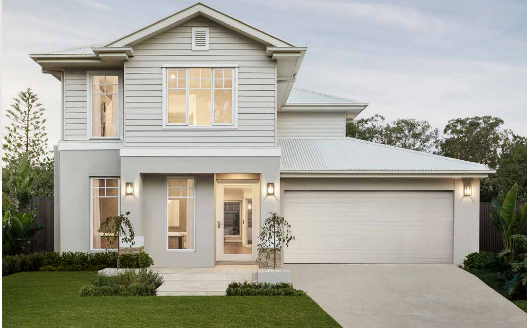
Monash 33 MKII – Paradise Lakes Estate, Willawong