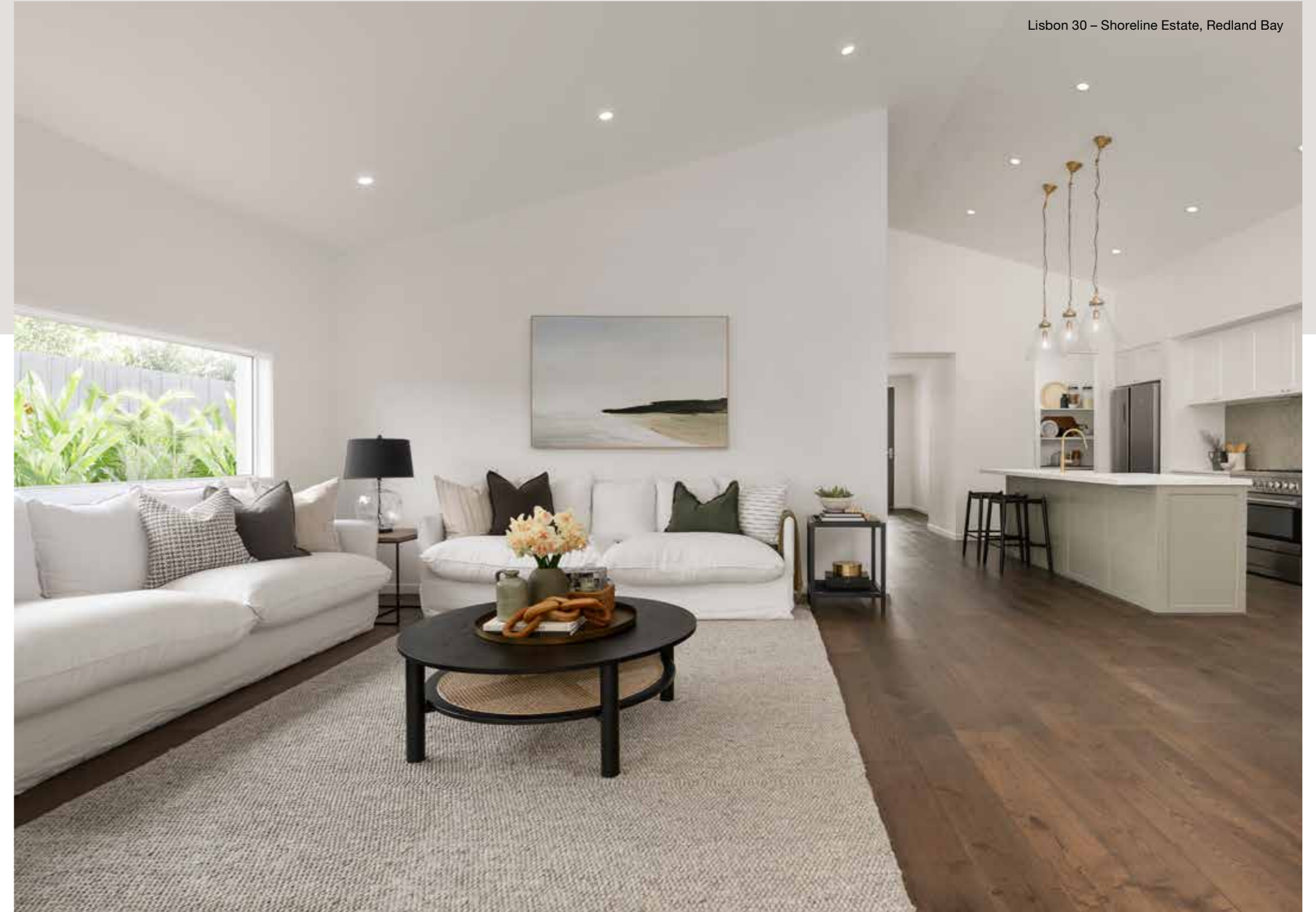
Lisbon 30 – Shoreline Estate, Redland Bay

In a farmhouse living space, natural materials such as linen furniture is paired with textured rugs and wooden flooring. Organic soft furnishings, florals and greenery ground the space.