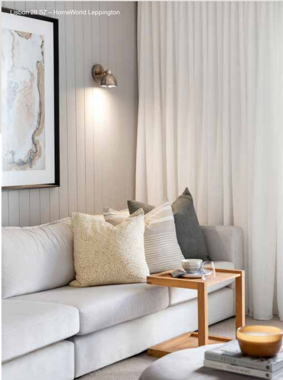
Lisbon 28 SZ – HomeWorld Leppington