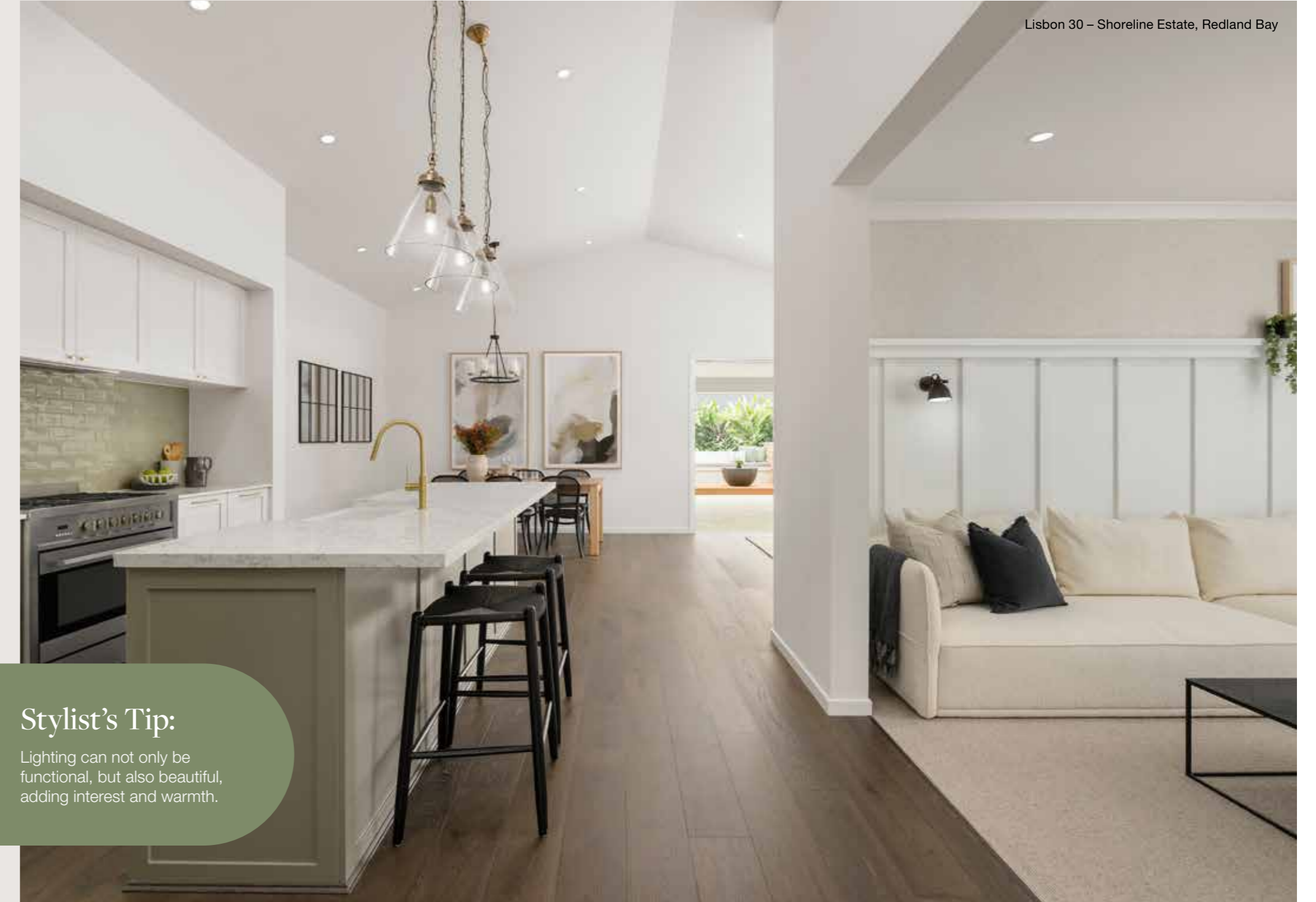
Lisbon 30 – Shoreline Estate, Redland Bay