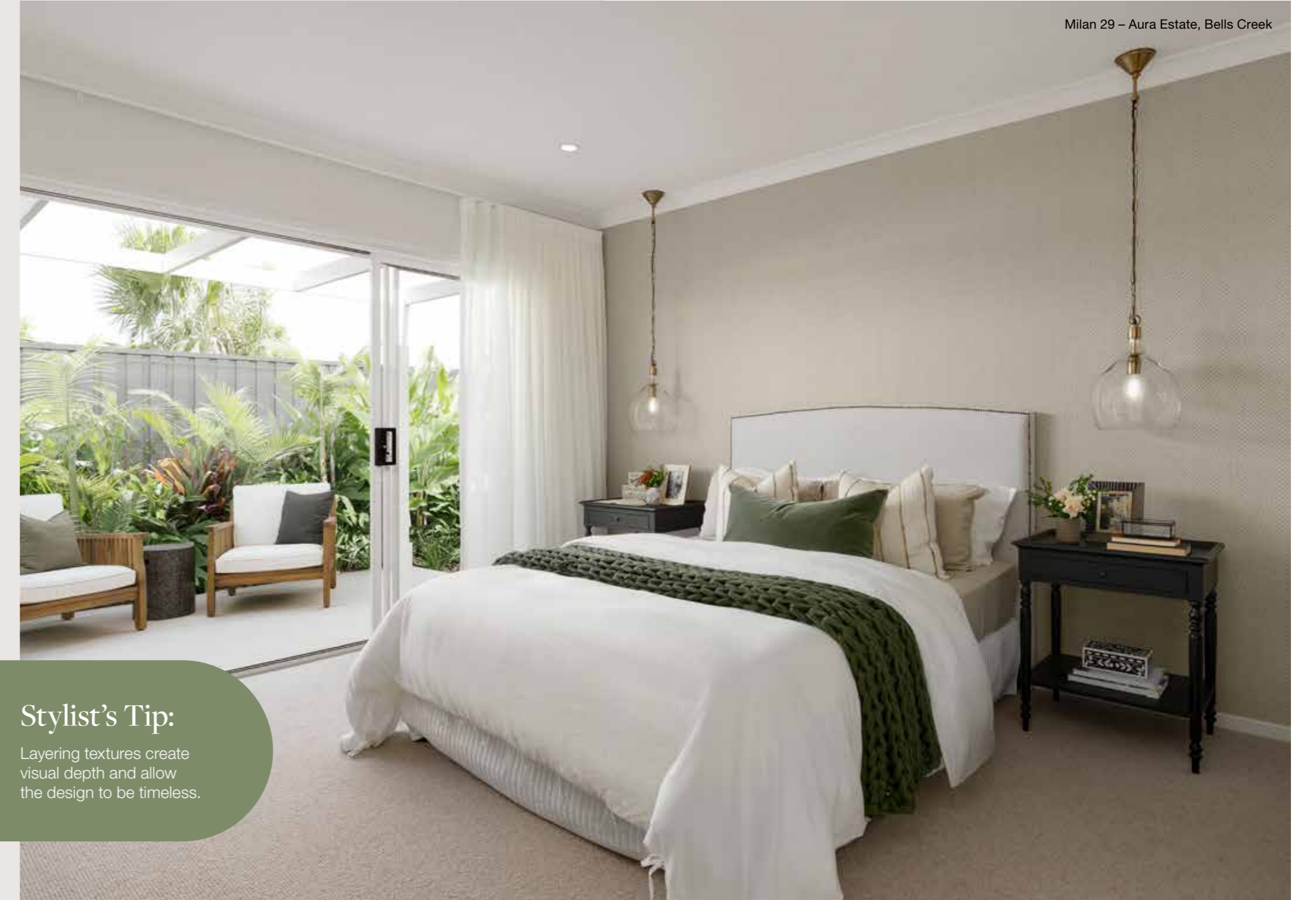
Milan 29 – Aura Estate, Bells Creek

Layering textures create visual depth and allow the design to be timeless.