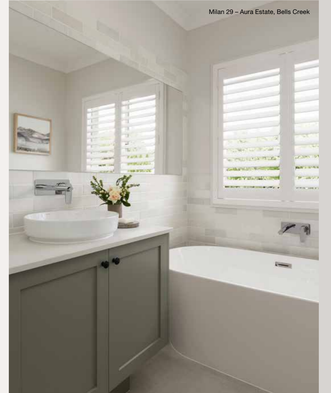
Milan 29 – Aura Estate, Bells Creek

A farmhouse bathroom is a calming sanctuary to retreat. Earthy green tones feature on bathroom cabinetry, with shaker detailing to match the kitchen. A small format square wall tile adds country character, while a patterned floor tile inspires a sense of creativity and fun.