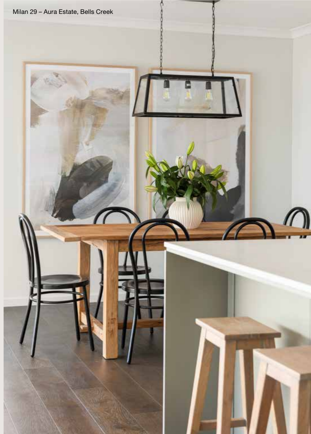
Milan 29 – Aura Estate, Bells Creek

The farmhouse colour palette is neutral, with subtle pops of colour, such as soothing green tones. A farmhouse home has an organic feel, with the warm features of a traditional design.