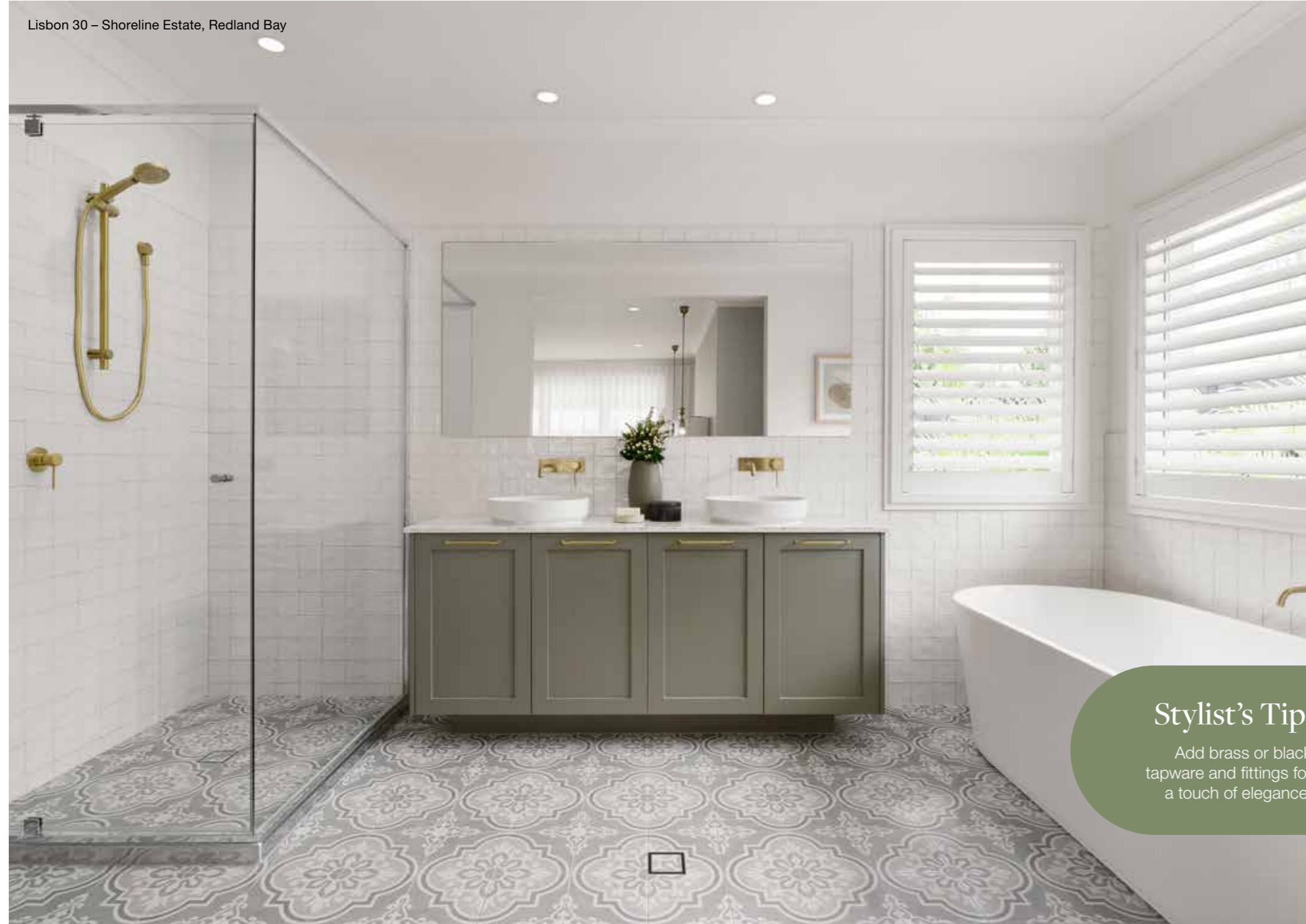
Lisbon 30 – Shoreline Estate, Redland Bay