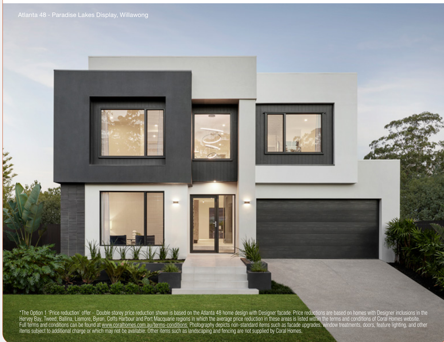
Atlanta 48 - Paradise Lakes Display, Willawong

*The Option 1 'Price reduction' offer - Double storey price reduction shown is based on the Atlanta 48 home design with Designer facade. Price reductions are based on homes with Designer inclusions in the Hervey Bay, Tweed, Ballina, Lismore, Byron, Coffs Harbour and Port Macquarie regions in which the average price reduction in these areas is listed within the terms and conditions of Coral Homes website. Full terms and conditions can be found at www.coralhomes.com.au/terms-conditions . Photography depicts non-standard items such as facade upgrades, window treatments, doors, feature lighting, and other items subject to additional charge or which may not be available. Other items such as landscaping and fencing are not supplied by Coral Homes.