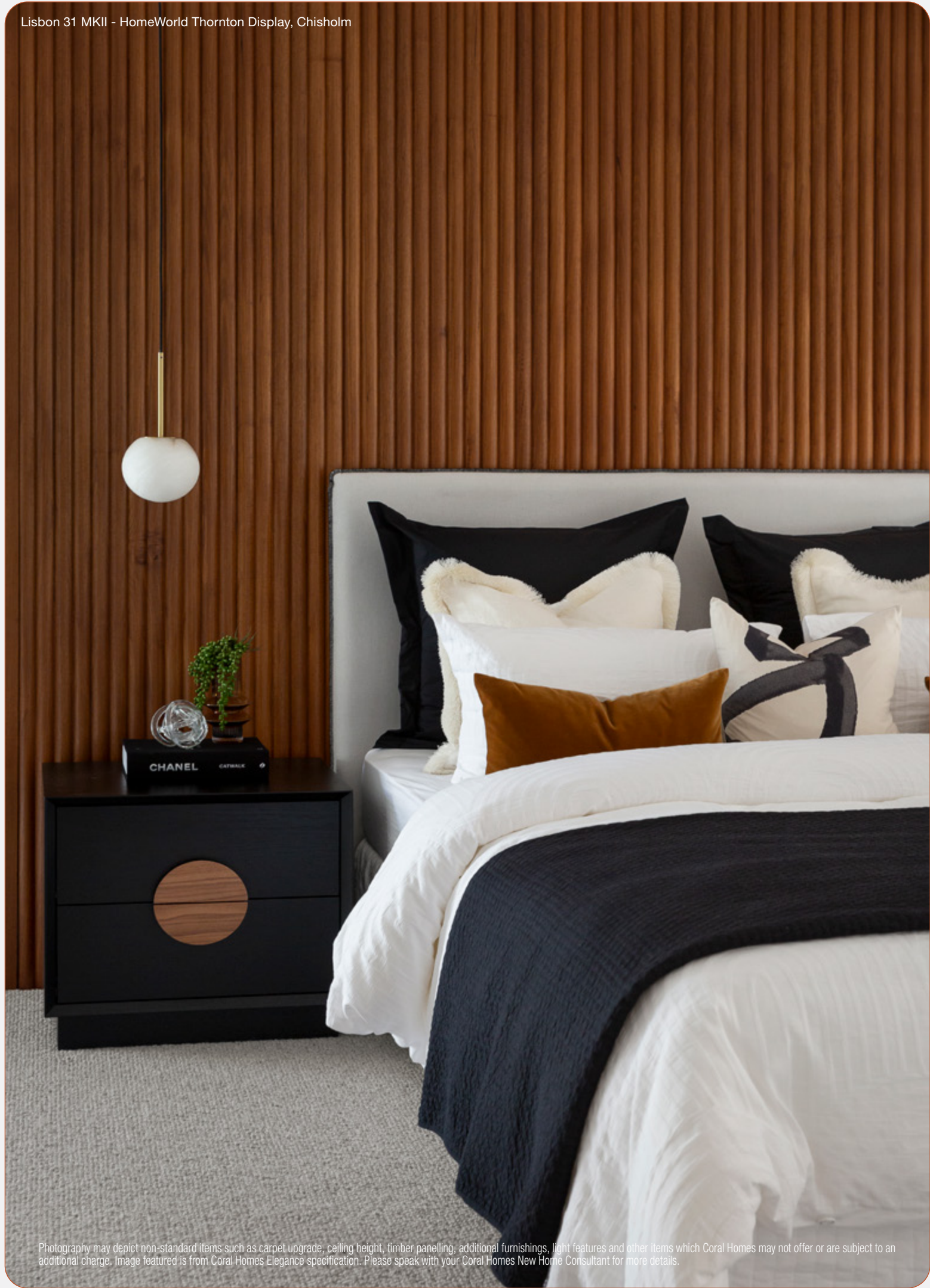
Photography may depict non-standard items such as carpet upgrade, ceiling height, timber panelling, additional furnishings, light features and other items which Coral Homes may not offer or are subject to an additional charge. Image featured is from Coral Homes Elegance specification. Please speak with your Coral Homes New Home Consultant for more details.