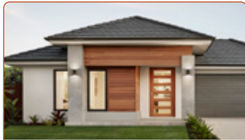
Grand Entry Door