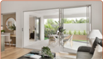
Alfresco Sliding or Stacker Door (2365mm high)