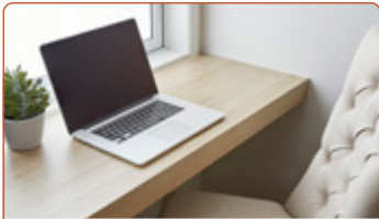
Tech Savvy Home