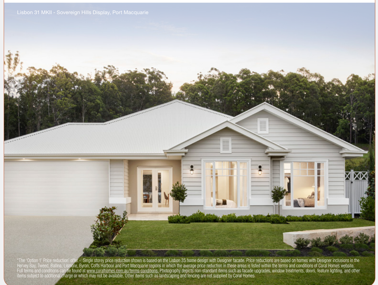
Lisbon 31 MKII - Sovereign Hills Display, Port Macquarie

*The 'Option 1' Price reduction' offer - Single storey price reduction shown is based on the Lisbon 35 home design with Designer facade. Price reductions are based on homes with Designer inclusions in the Hervey Bay, Tweed, Ballina, Lismore, Byron, Coffs Harbour and Port Macquarie regions in which the average price reduction in these areas is listed within the terms and conditions of Coral Homes website. Full terms and conditions can be found at www.coralhomes.com.au/terms-conditions . Photography depicts non-standard items such as facade upgrades, window treatments, doors, feature lighting, and other items subject to additional charge or which may not be available. Other items such as landscaping and fencing are not supplied by Coral Homes.