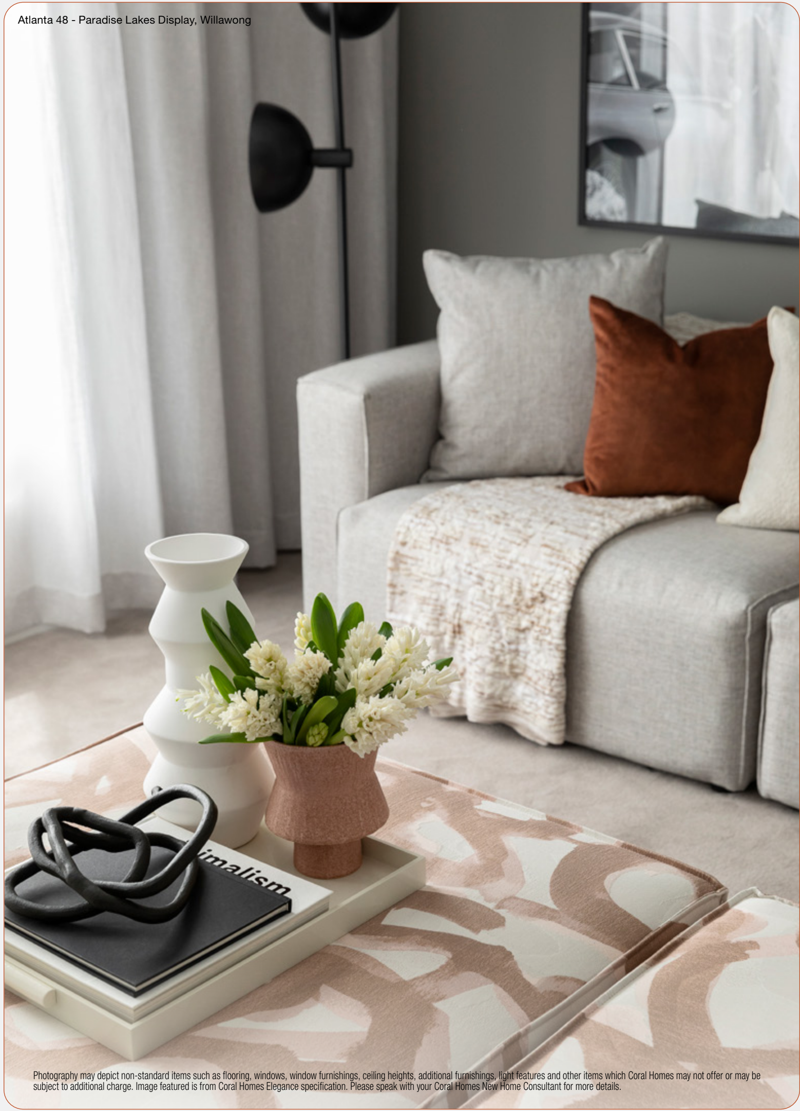
Photography may depict non-standard items such as flooring, windows, window furnishings, ceiling heights, additional furnishings, light features and other items which Coral Homes may not offer or may be subject to additional charge. Image featured is from Coral Homes Elegance specification. Please speak with your Coral Homes New Home Consultant for more details.