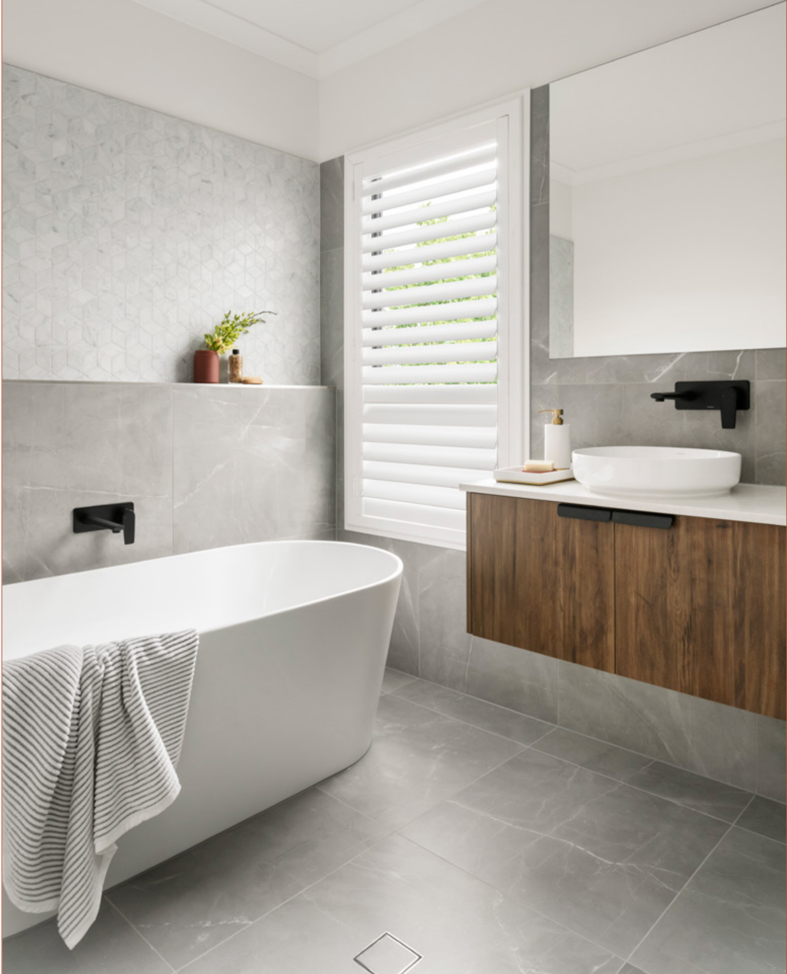
Photography depicts non-standard items such as flooring upgrades, cabinetry finishes, window treatments, benchtops, basins, tapware, bath, mirror, ceiling height, tiling and other items which are subject to an additional charge or which may not be offered by Coral Homes. Image featured is from Coral Homes Elegance specification and features upgraded items. Please speak with your Coral Homes New Home Consultant for more details.