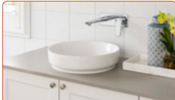
Custom Designed Vanity