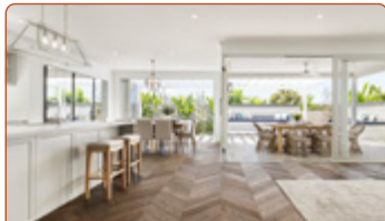
High Ceilings (2550mm)