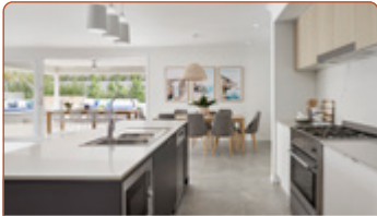
Kitchen Appliances (900mm)