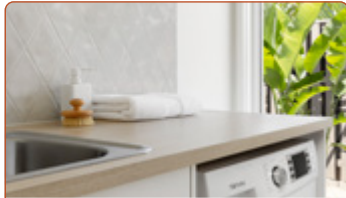
Laundry Benchtop (up to 1300mm)