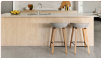
Tiling (builder's standard range)