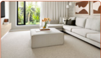
Carpet (builder's standard range)

For a limited time only, get that display home look you love with all of our best home upgrades in one package.